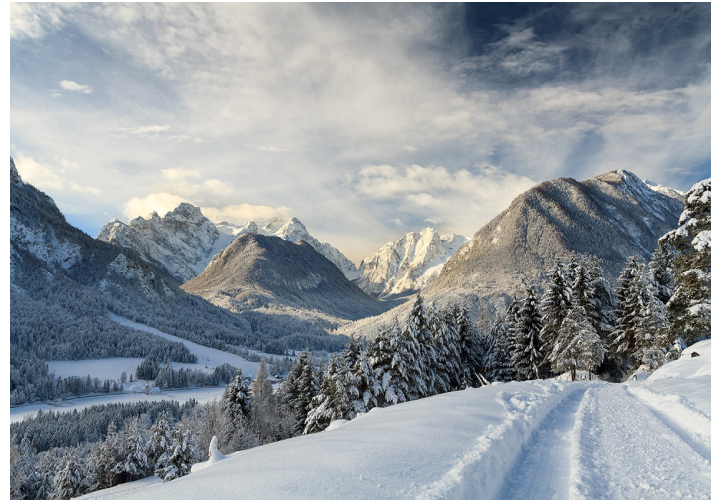
Mojstrana in Winter