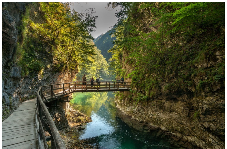
Vintgar Gorge

There is also the Pokljuka Gorge with its natural bridges, pools and rapids, as well as the Dovžan Gorge with its palaeozoic fossils, settlement in the heart of the Karavanke mountain range.