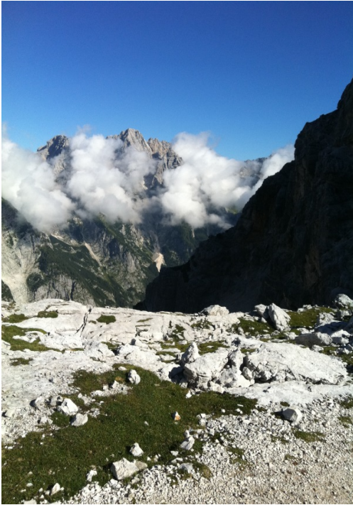
Mount Triglav, Photo by Ana Jakelic

The Triglav National Park, boasting a number of peculiarities, is the largest and the earliest protected natural heritage site in the country. It is located in the north-west of Slovenia, more precisely in the Julian Alps. The park was named after the highest mountain of Slovenia, the Triglav, which is located nearly at the center of the park. It is the only National Park in Slovenia and among the earliest European parks.