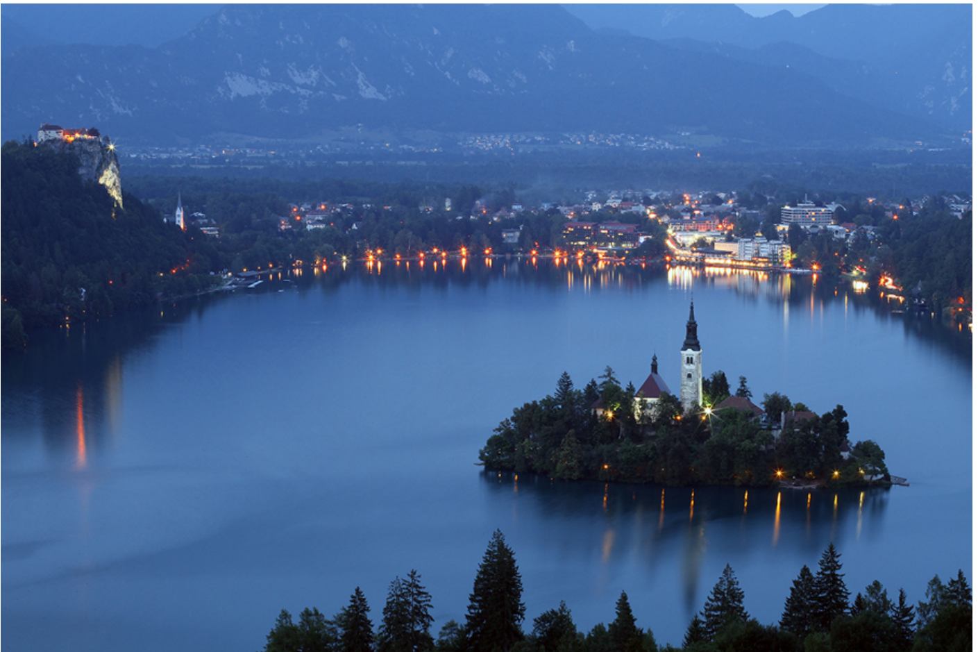
Lakes, Waterfalls and Rivers

Nearby there is also Mala Pišnica, a protected forest reserve with karstic caves and abysses. Not far from Bled and Bohinj is the cave under Babji Zob, one of the oldest Slovenian underground beauties.