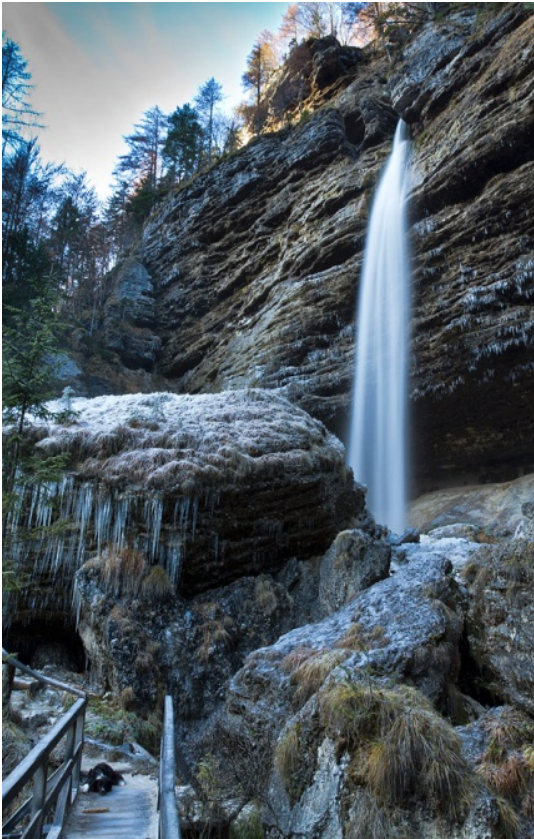
Peričnik Waterfalls

The best known Slovenia's alpine waters are combined of world famous Lake Bled with its island in the middle, Bohinj the country's largest lake, and the famous Seven Lakes Valley in the Triglav National Park.