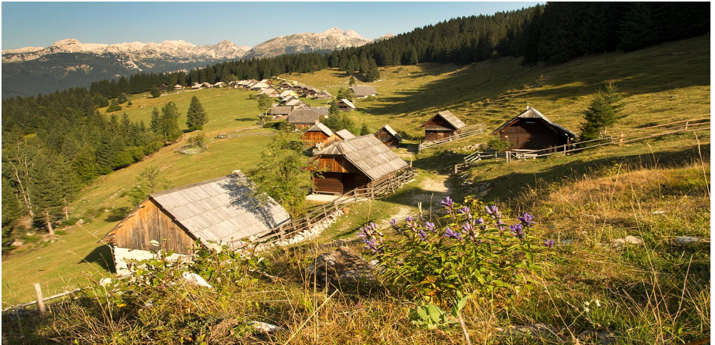
Plansarska planina, Pokljuka