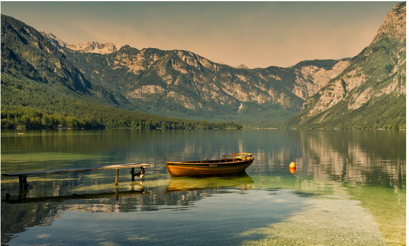
Lake Bohinj