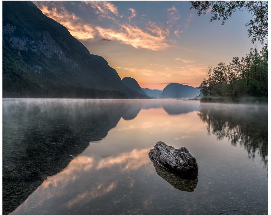
Lake Bohinj Photos: the photographer is Bor Rojnik